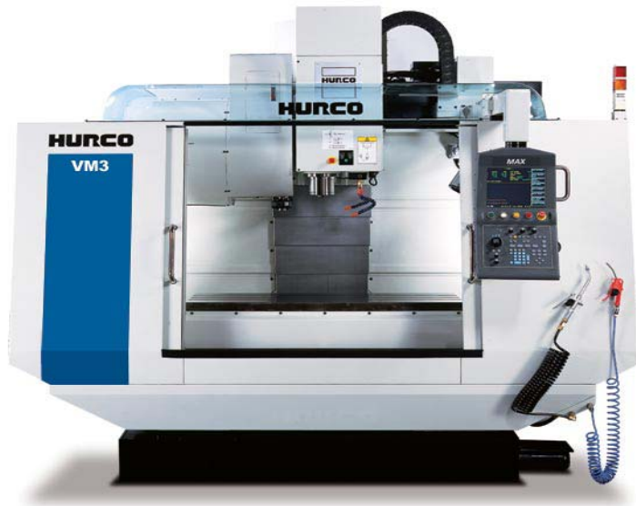
Hurco VM3 20 ATC Vertical Machining Centre Equipped with Dust Extraction