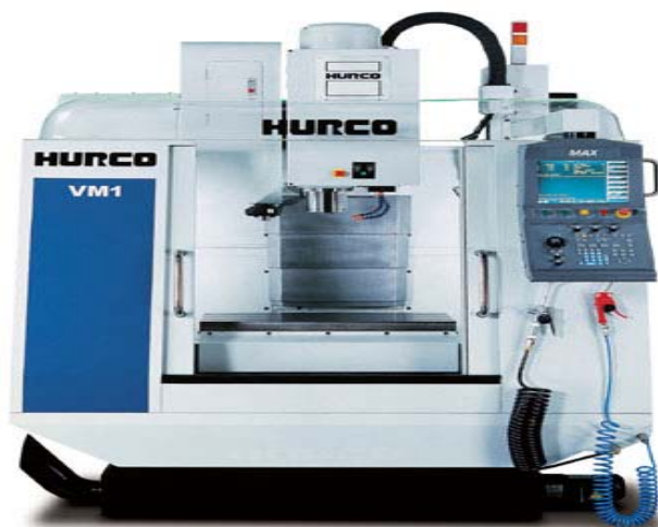
Hurco VM1 16 ATC Vertical Machining Centre Equipped with Dust Extraction