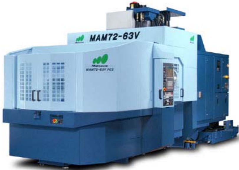
Matsuura MAM72-63V – Twin Pallet 5-Axis Machining Centre