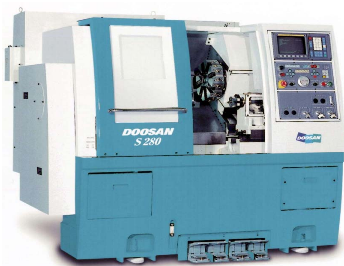
Doosan S280 CNC Turning Centre