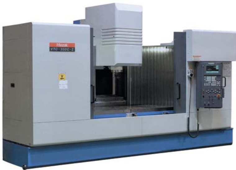
Yamazaki Mazak VTC300C2 Vertical Travelling Column Machining Centre