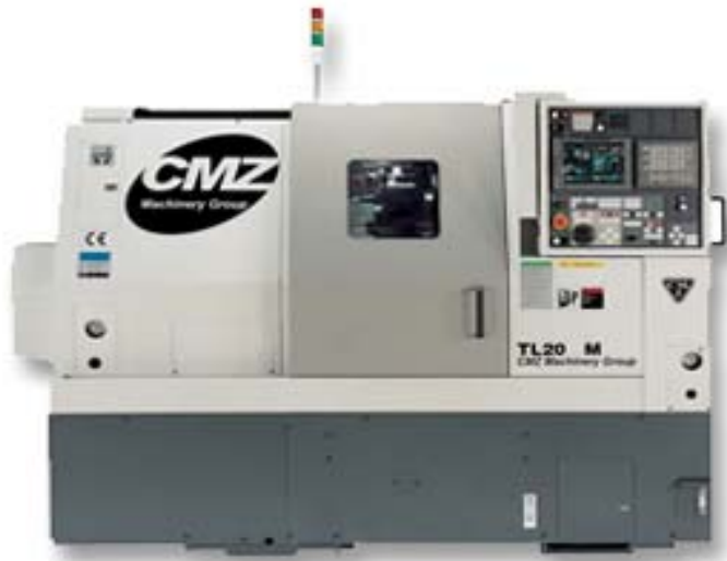
CMZ TL20 CNC Turning Centre