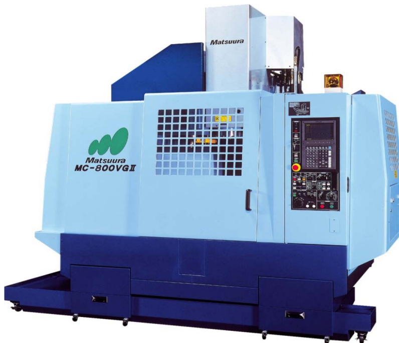
Matsuura MC-800 VG 11 5 Axis Machining Centre