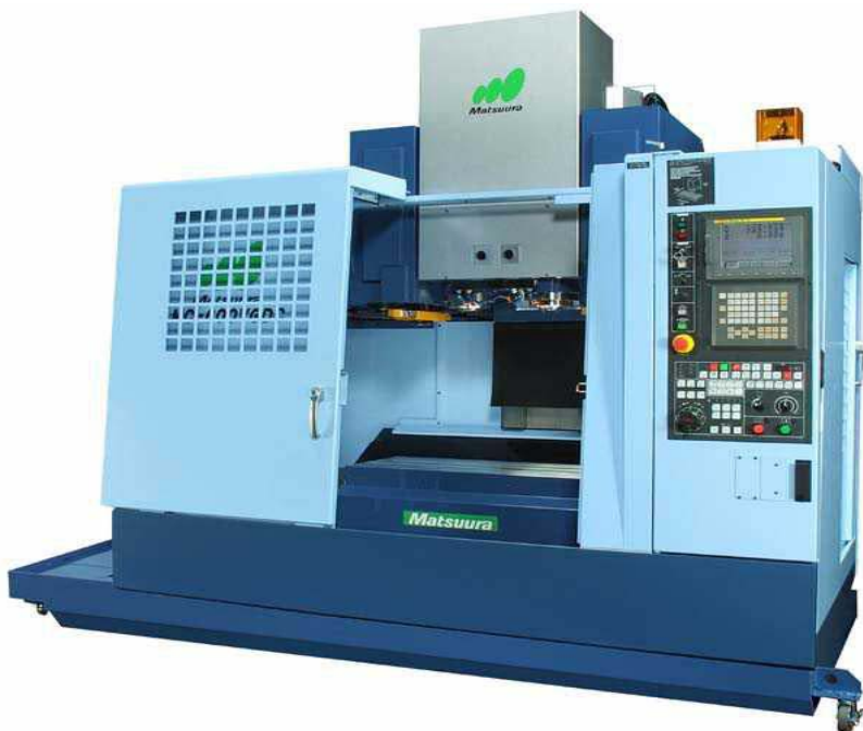
Matsuura MC600VF Machining Centre