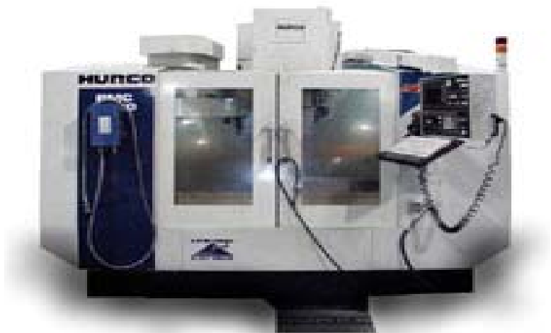
Hurco BMC25 20 ATC Vertical Machining Centre Equipped with Dust Extraction