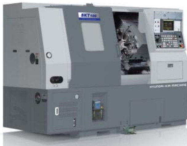
Kia Turn SKT100 CNC Turning Centre