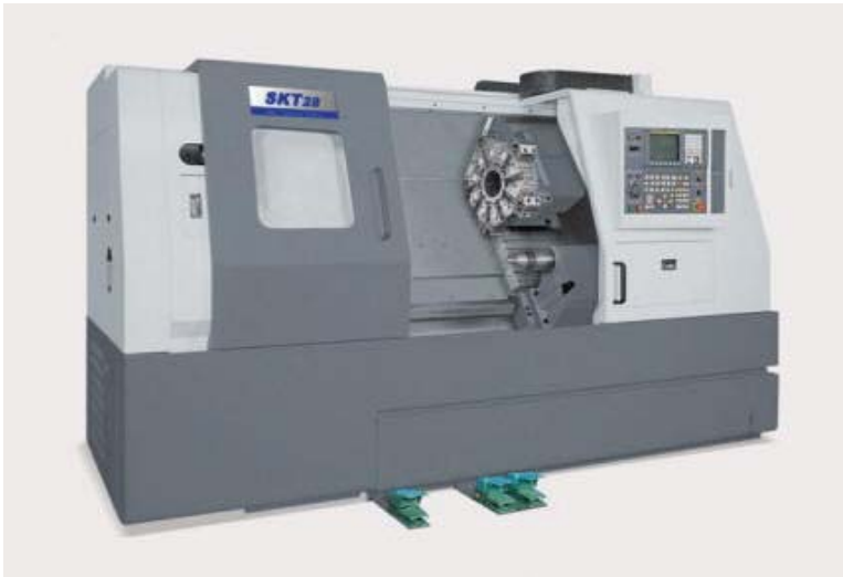
Kia Turn 28L CNC Turning Centre