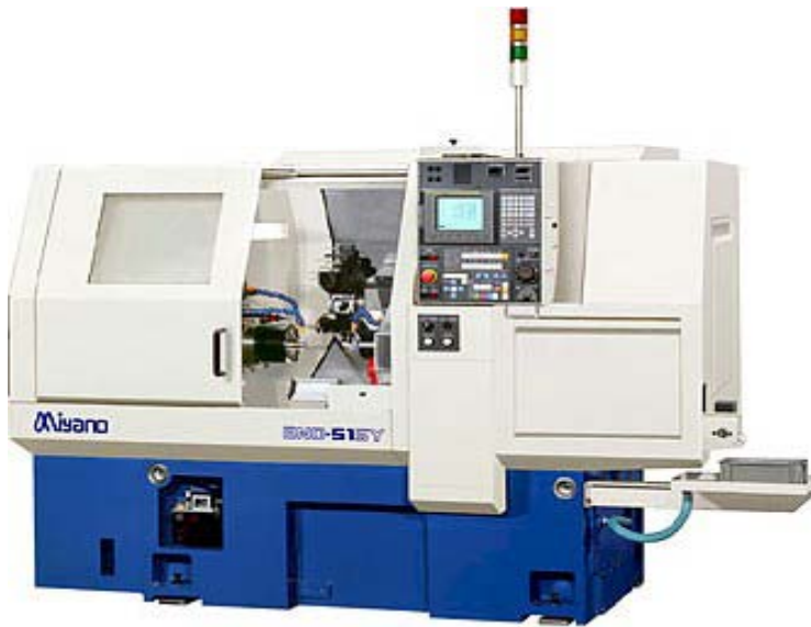
Miyano BND-51 SY 4 axis CNC Turning Centre Driven Tools, Sub Spindle, C & Y Axis