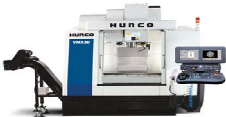
Hurco BMC30 20 ATC Vertical Machining Centre Equipped with Dust Extraction