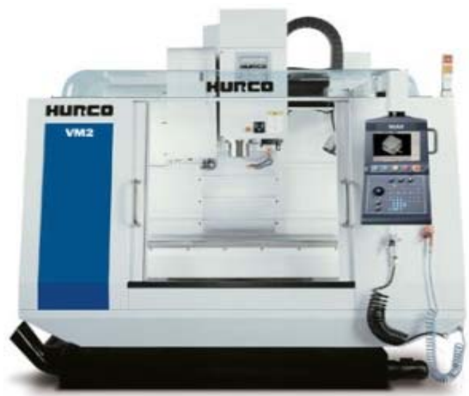
Hurco VM2 16 ATC Vertical Machining Centre Equipped with Dust Extraction